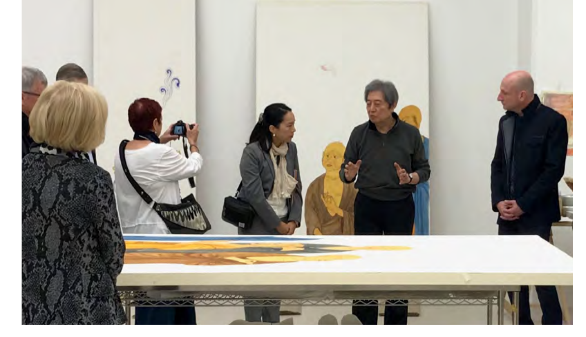
A tour with Portland Japanese Garden patrons visits the studio of former Prime Minister Hosokawa Morihiro .