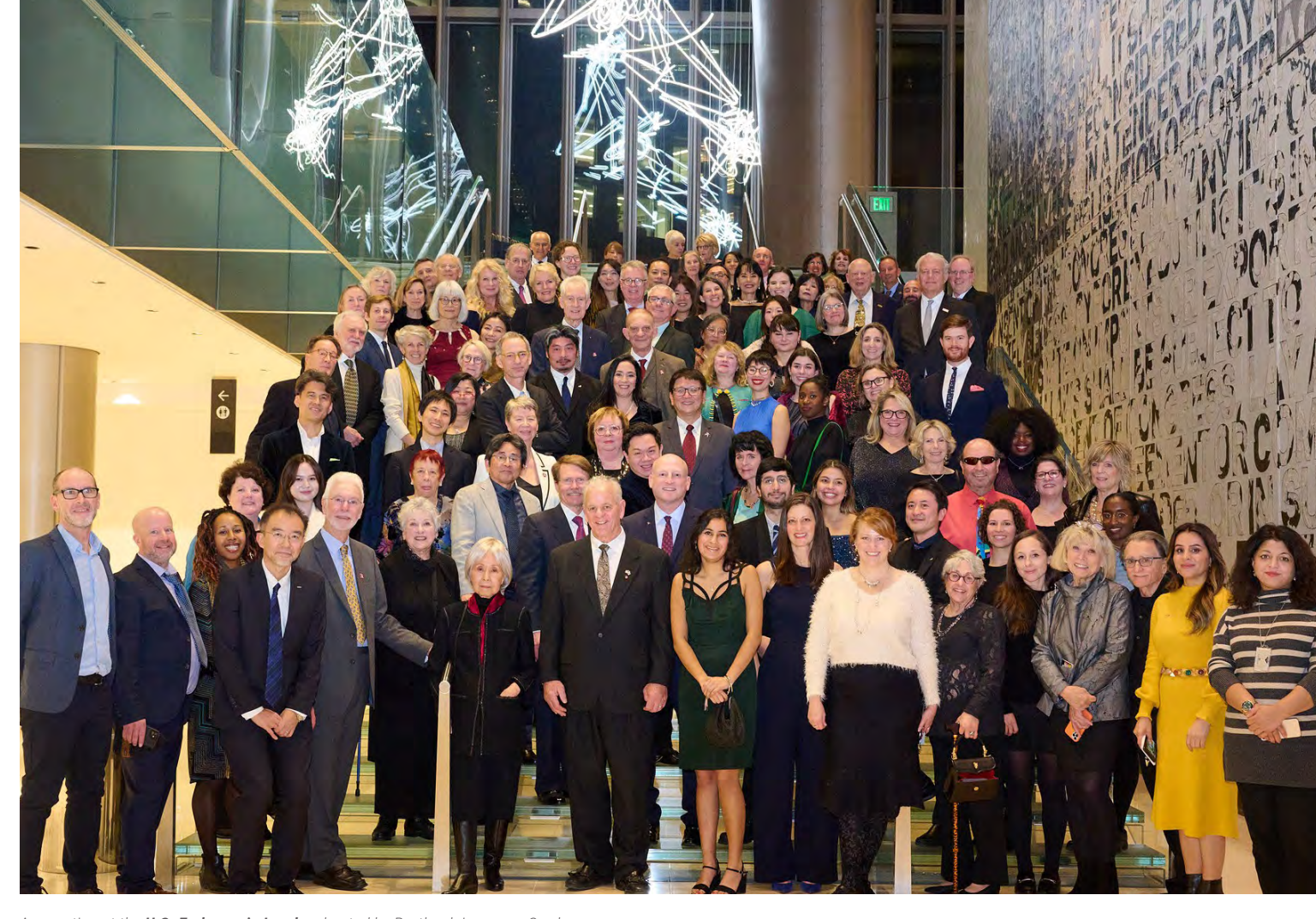
A reception at the U.S. Embassy in London , hosted by Portland Japanese Garden and Japan Institute.