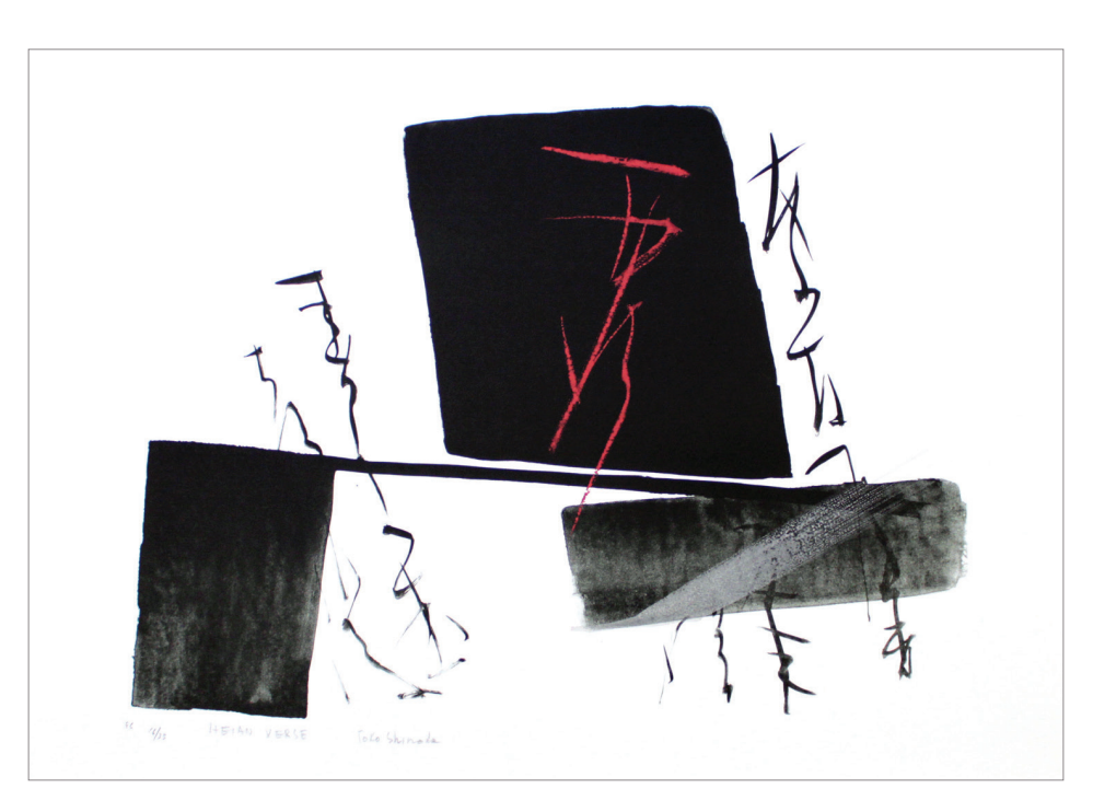
Heian Verse, Toko Shinoda, 1996