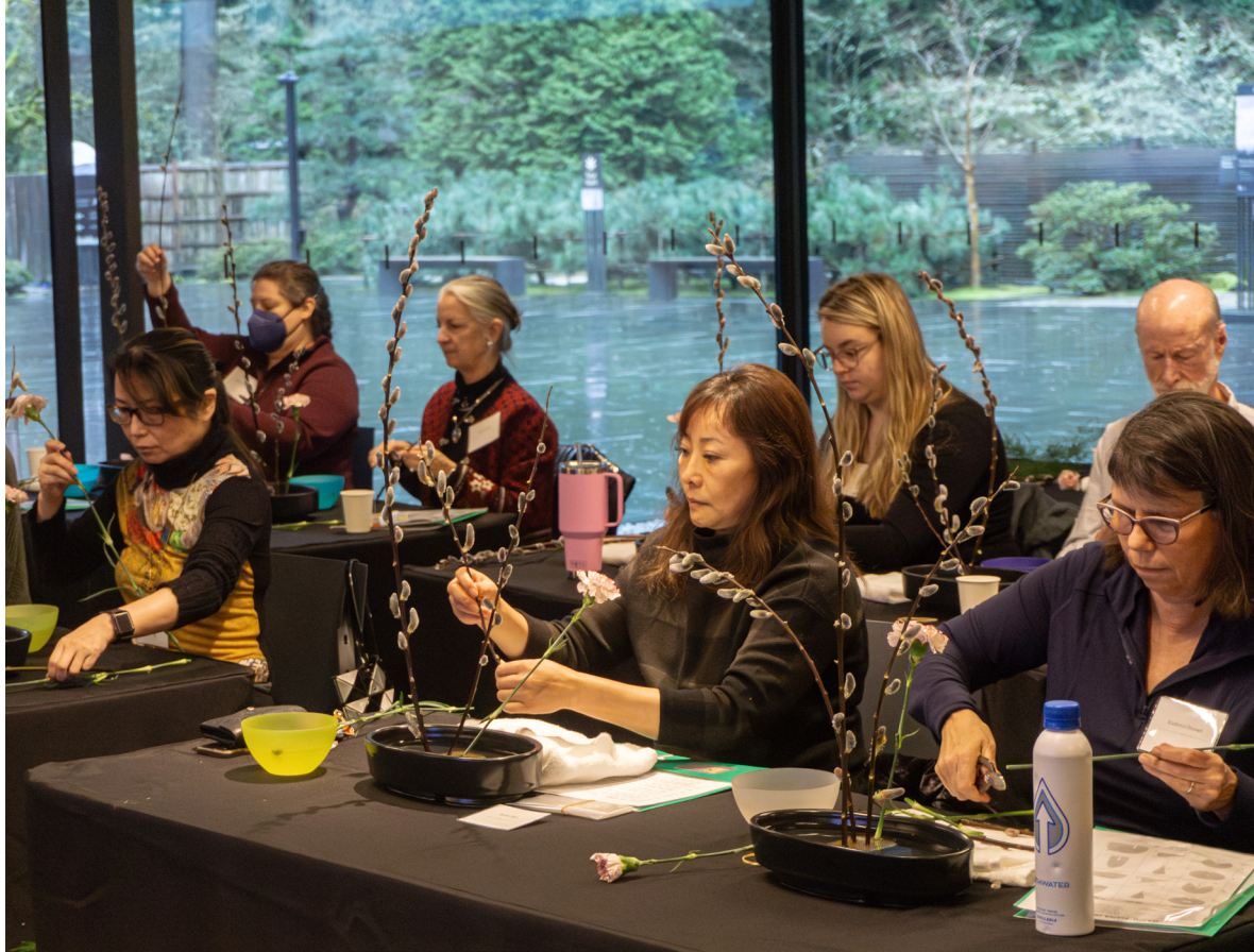
Participants in an ikebana workshop in the Yanai Family Classroom.