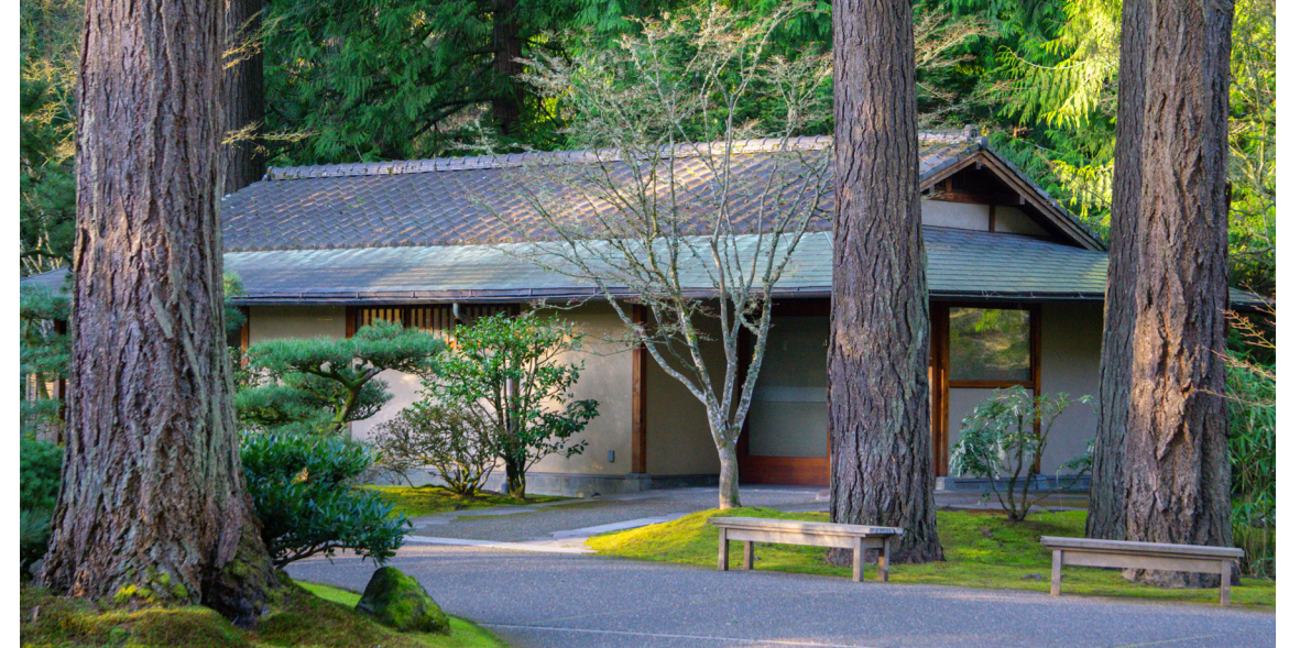
The Membership Center, opening soon, between the Strolling Pond and Flat Gardens, adjacent to the wisteria arbor.

Meanwhile, special Extended Hours for members return starting in May! Take advantage of the extended light of summer and enjoy quiet evenings at the Garden. Advance reservations are not required, and member guests are welcome. Details for additional extended hours can be found on our website, japanesegarden.org/events