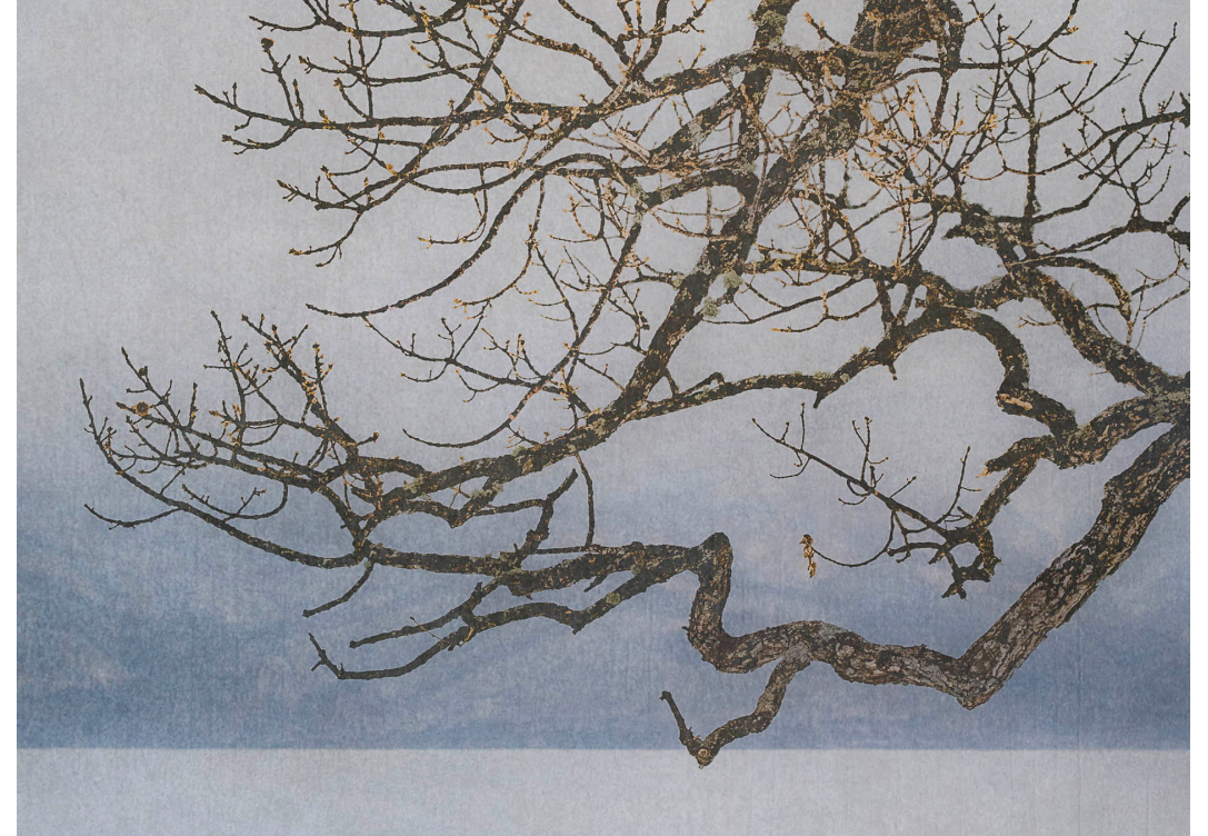
"Winterview," February 2023. Teshikaga, Kawakami-Gun, Hokkaido, Japan.

"Each and every light shapes Sapporo. The people who live here, the people who come here, and the people who pass through create the scenery of Sapporo."