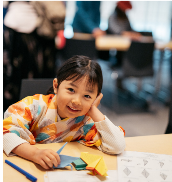
A young garden guest working on some origami during Children's Day in 2023.

Children's Day is observed in Japan as a day to honor all children in the hopes that they will grow up healthy and strong. Cloth carp streamers, or koinobori , are flown to bring good fortune to children. Come to the Garden with your family to listen to taiko music performed by children, participate in a scavenger hunt, create origami projects, and satisfy your curiosity about koi.