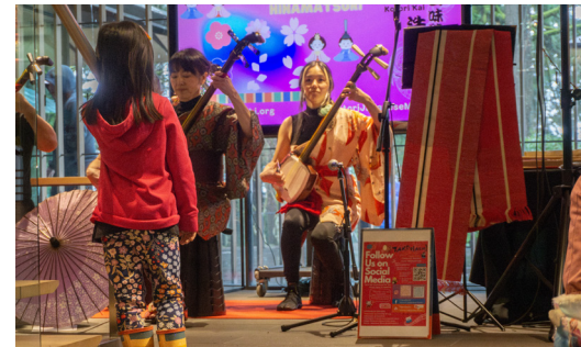
A young Garden guest gets a closer look at a performance by TAKOHACHI – Kotori Kai Shamisen School during our Hina Matsuri celebration in March.