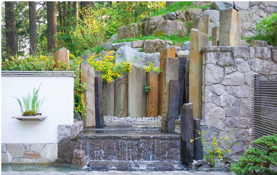
Portland Japanese Garden