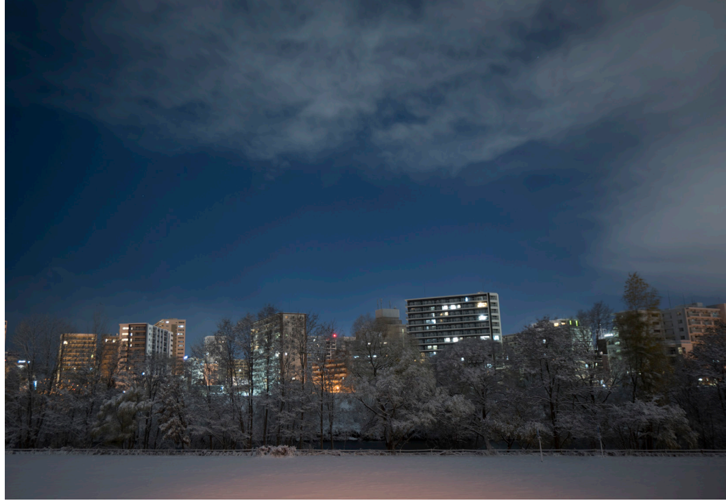
"Lights of My City," 2023.