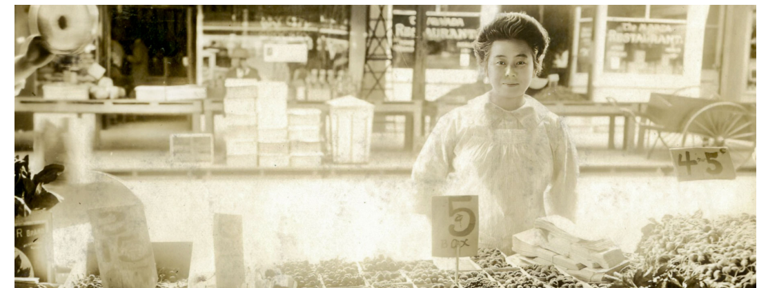
An outdoor market in Japantown.

To read the full article go to japanesegarden.org/oregon-nikkei