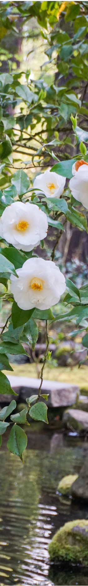
Portland Japanese Garden