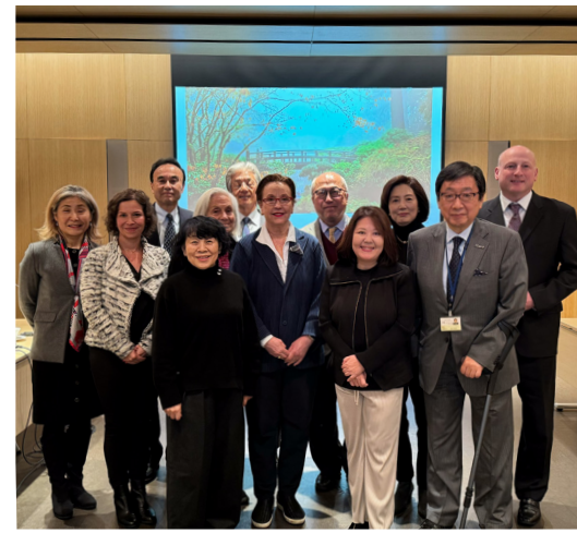
Portland Japanese Garden and Japan Institute staff meeting with the organizations' International Advisory Board in Tokyo in March.