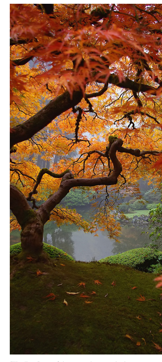
"The Tree," one of the most photographed trees in the world. Richard Welander

While factors like temperature, light, and water all affect the onset and duration of the Garden's autumn aesthetics, one can expect to start to see the transformation throughout the month of October. To help members and guests plan their visit, the Garden has set up its fall color tracker, which can be found at japanesegarden.org/fall-2023