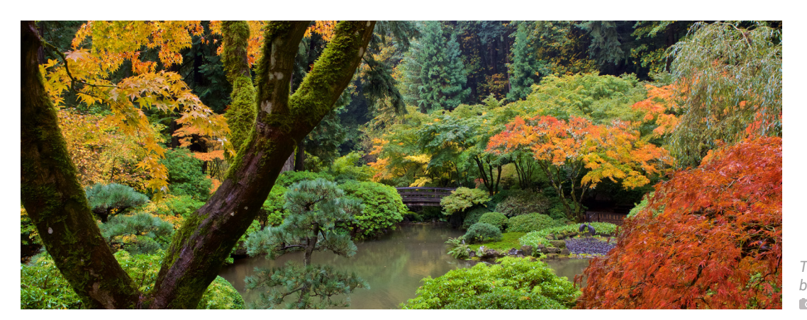
The Strolling Pond Garden basking in autumn colors. • Wayne Williams