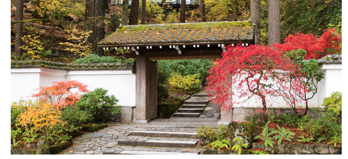
The Antique Gate surrounded by welcoming fall colors.