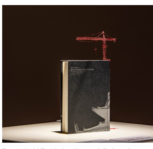
Tectonic Model (Paul Anderer, Kurosawa's Rashomon) by Takahiro Iwasaki, 2023. Danathan Ley

October 19 / 4:30 - 6:00pm October 23 / 4:30 - 6:00pm November 2 / 4:30 - 6:00pm