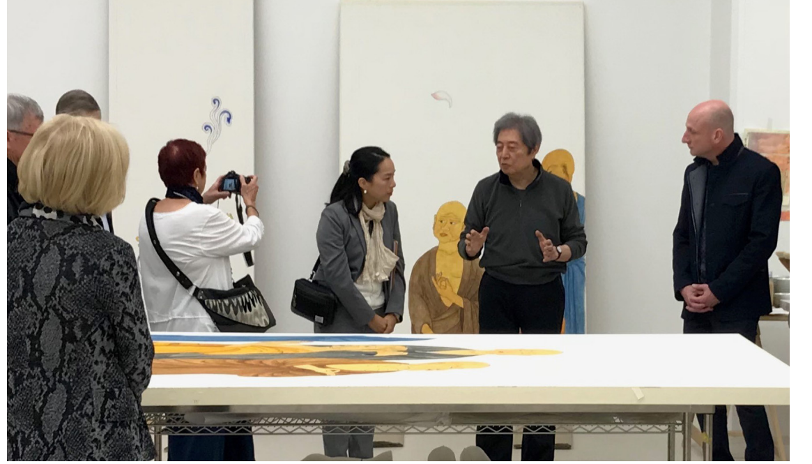
A tour with Portland Japanese Garden patrons visits the studio of former Prime Minister Hosokawa Morihiro.