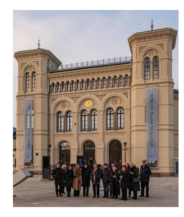
The Nobel Peace Center in Oslo, Norway, a highlight of the patron tour in 2022.