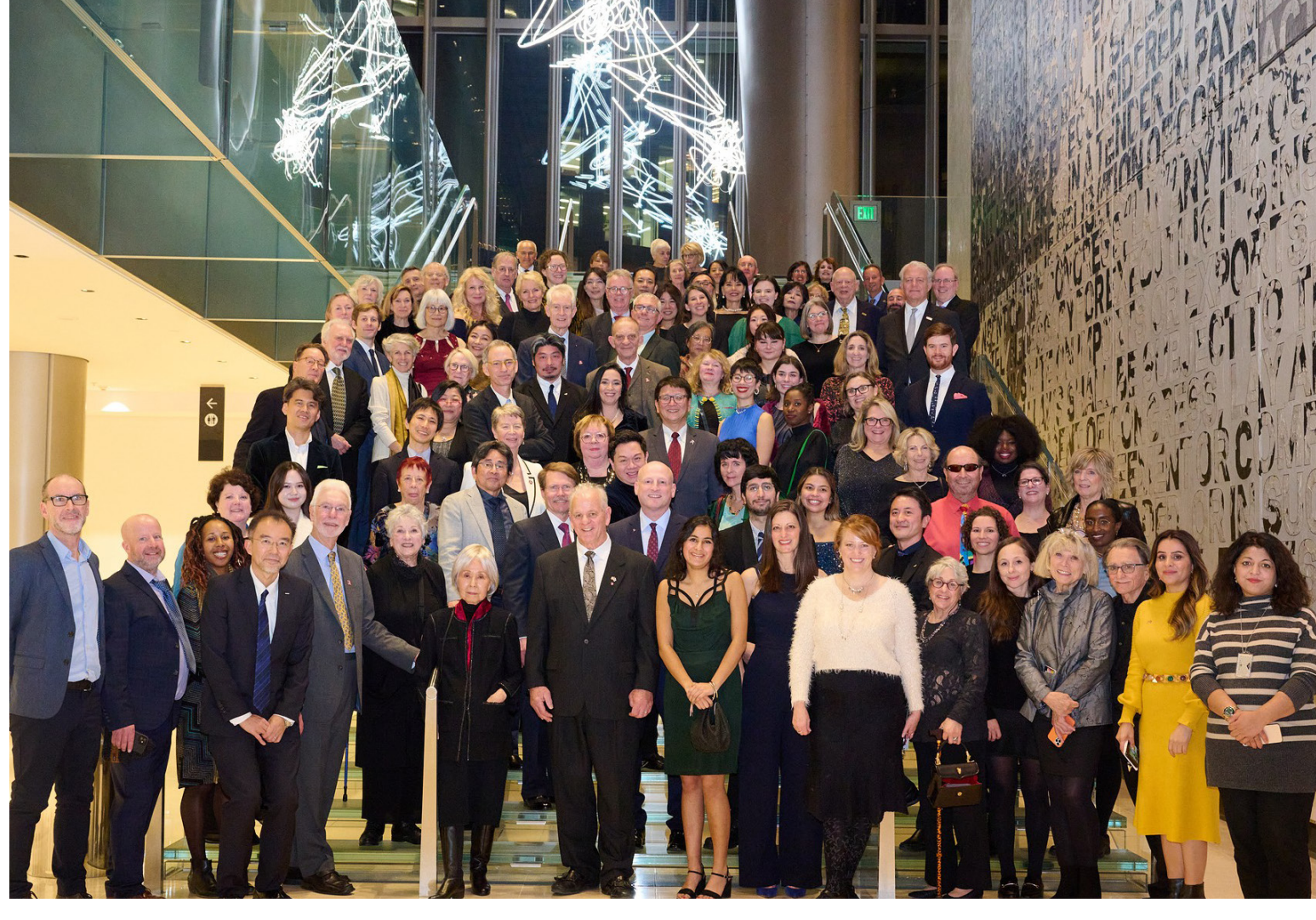
A reception at the U.S. Embassy in London , hosted by Portland Japanese Garden and Japan Institute.