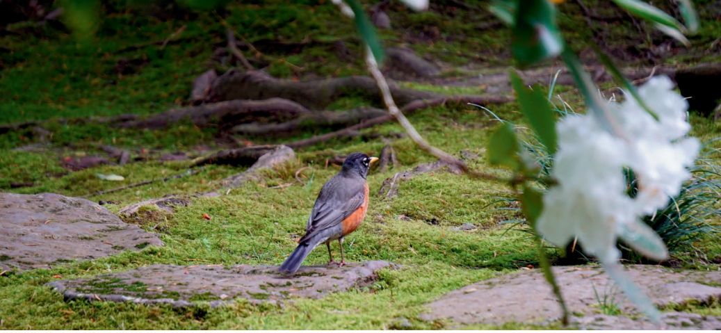
Portland Japanese Garden