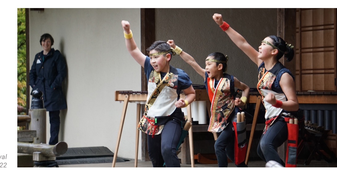
Children's Day festival in May 2022