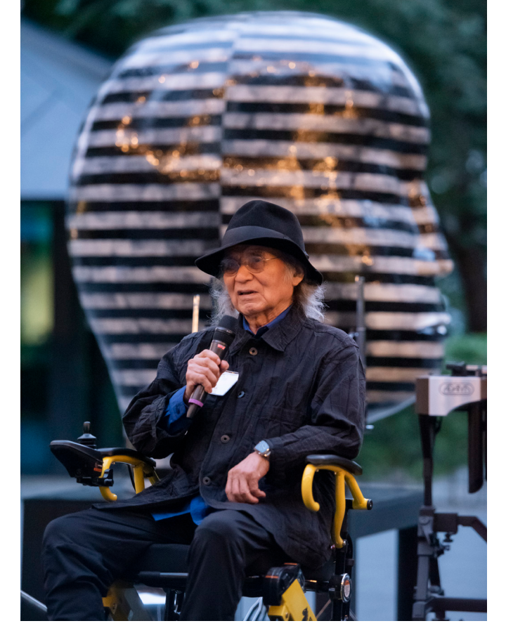
Artist Jun Kaneko at the opening reception for the exhibition Garden of Resonance.