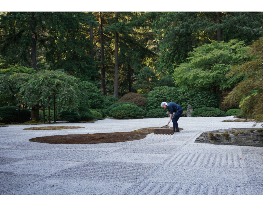
The Flat Garden sand raked in a special checkered pattern for Moonviewing Festival