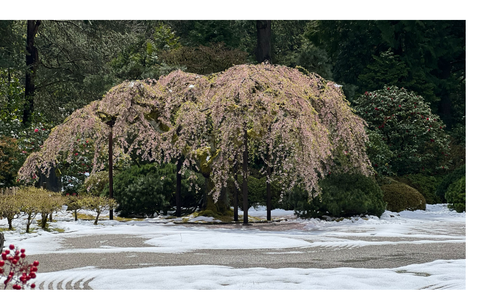
Weeping cherry in the Flat Garden after a surprise snow storm in April 2022