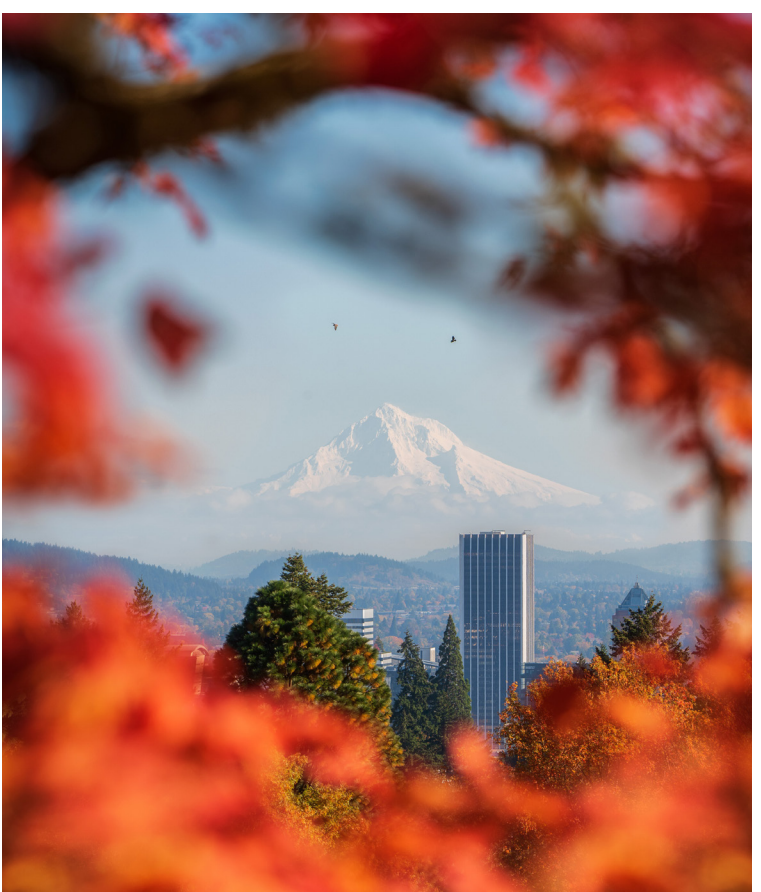
Mt. Hood framed by vibrant fall colors at the Garden.