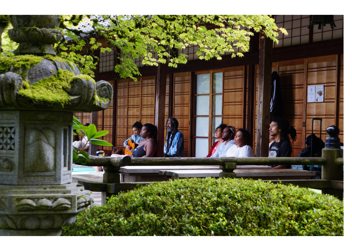
Portland Japanese Garden hosted a meditation event for Black Men's Wellness on Juneteenth and Father's Day.