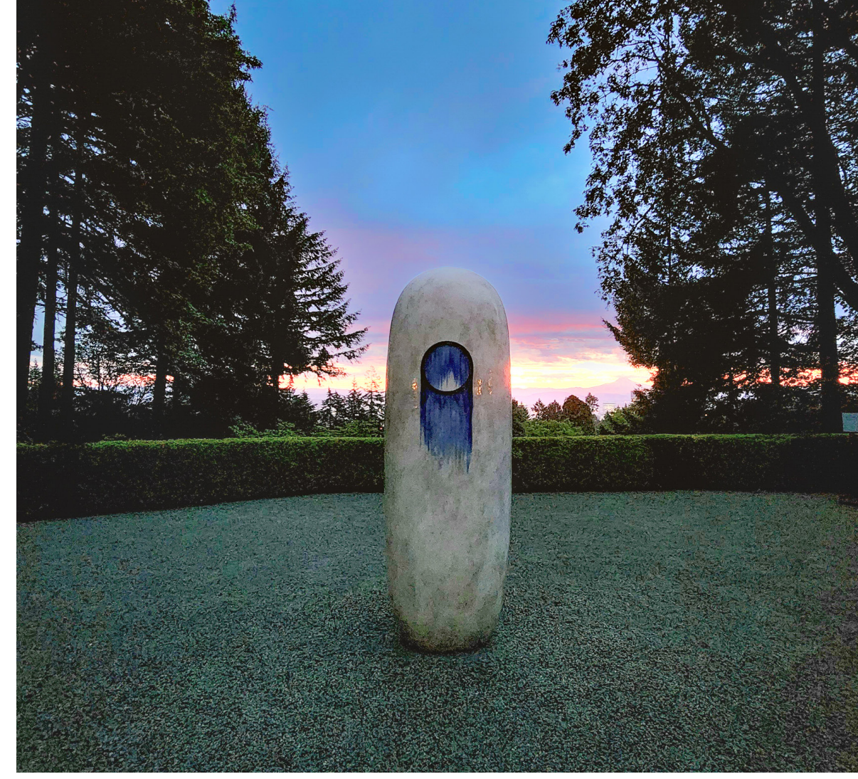
Mt Hood Overlook at sunset, with Jun Kaneko's Dango sculpture in the foreground.