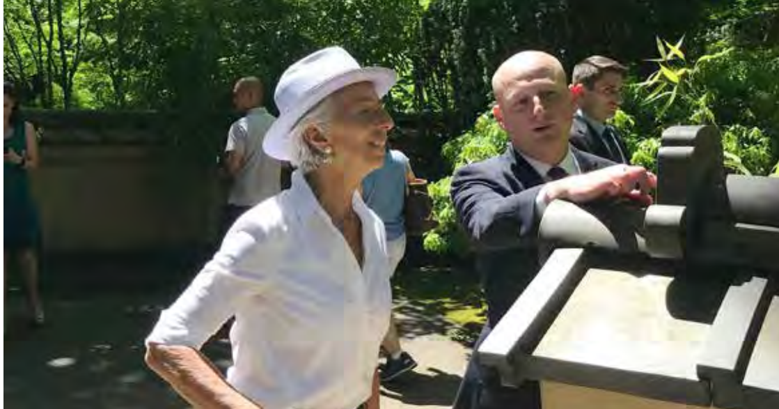
Former Managing Director of the International Monetary Fund (IMF) Christine Lagarde tours Portland Japanese Garden.