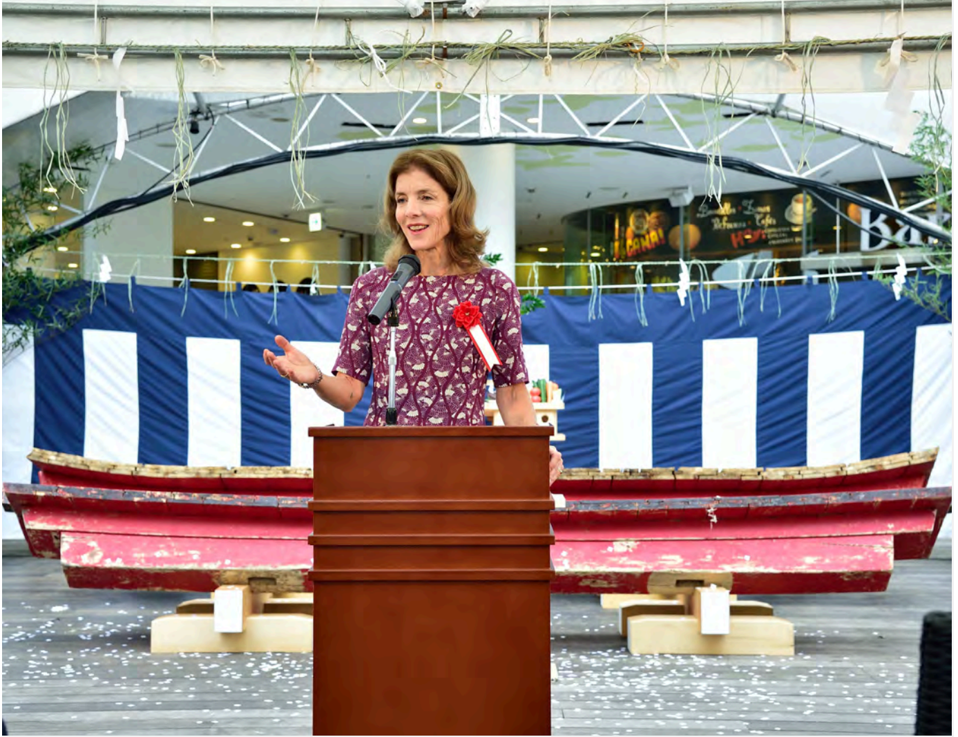
Former U.S. Ambassador to Japan Caroline Kennedy addresses a delegation from Portland Japanese Garden in Yokohama.