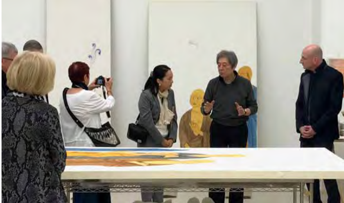
A tour with Portland Japanese Garden patrons visits the studio of former Prime Minister Hosokawa Morihiro .