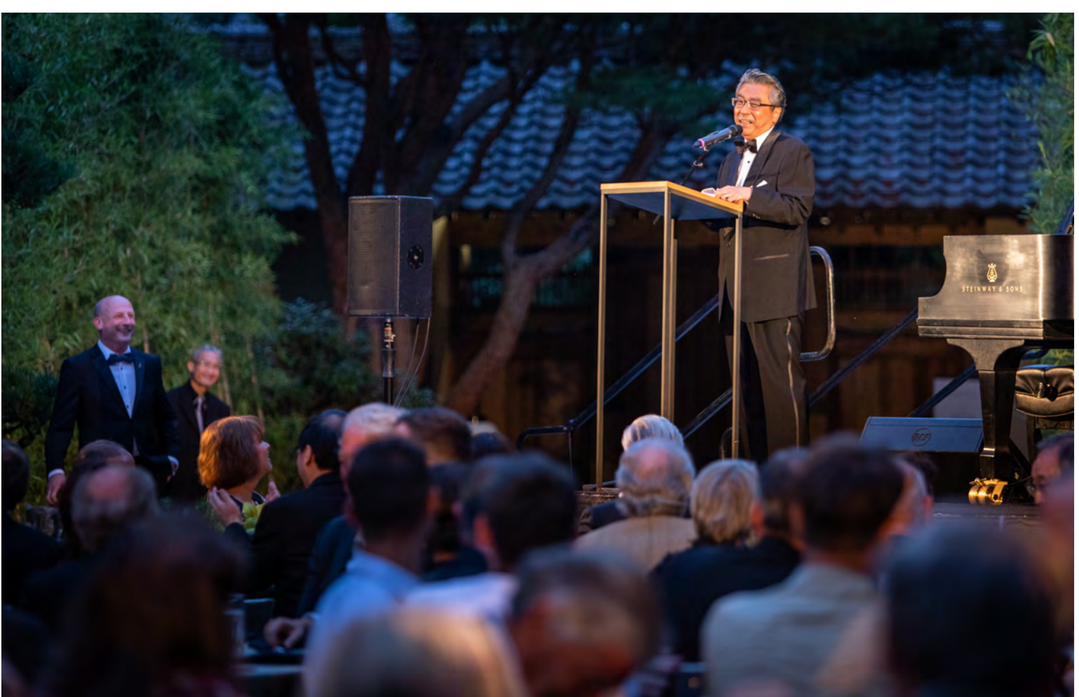
Ambassador Extraordinary and Plenipotentiary of Japan to the United States of America, Sugiyama Shinsuke speaks at the 55th anniversary Gala.