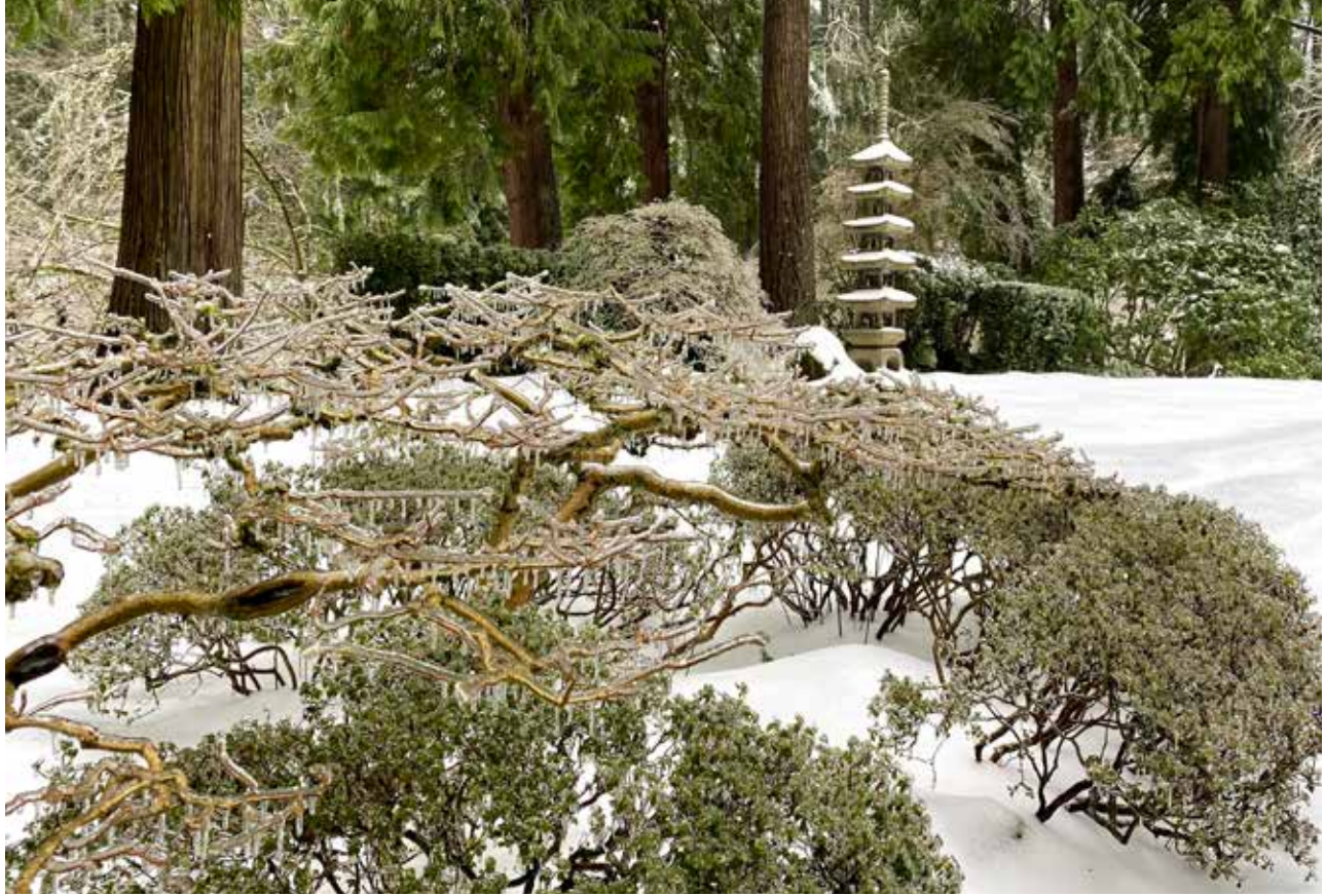
TOP Marketing Dept.