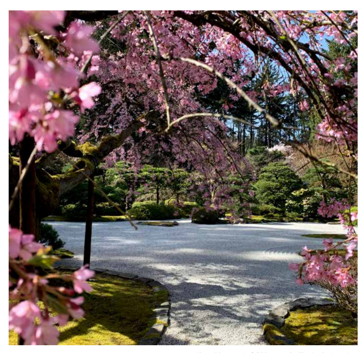
Cherry blossoms in full bloom at the Flat Garden in spring.