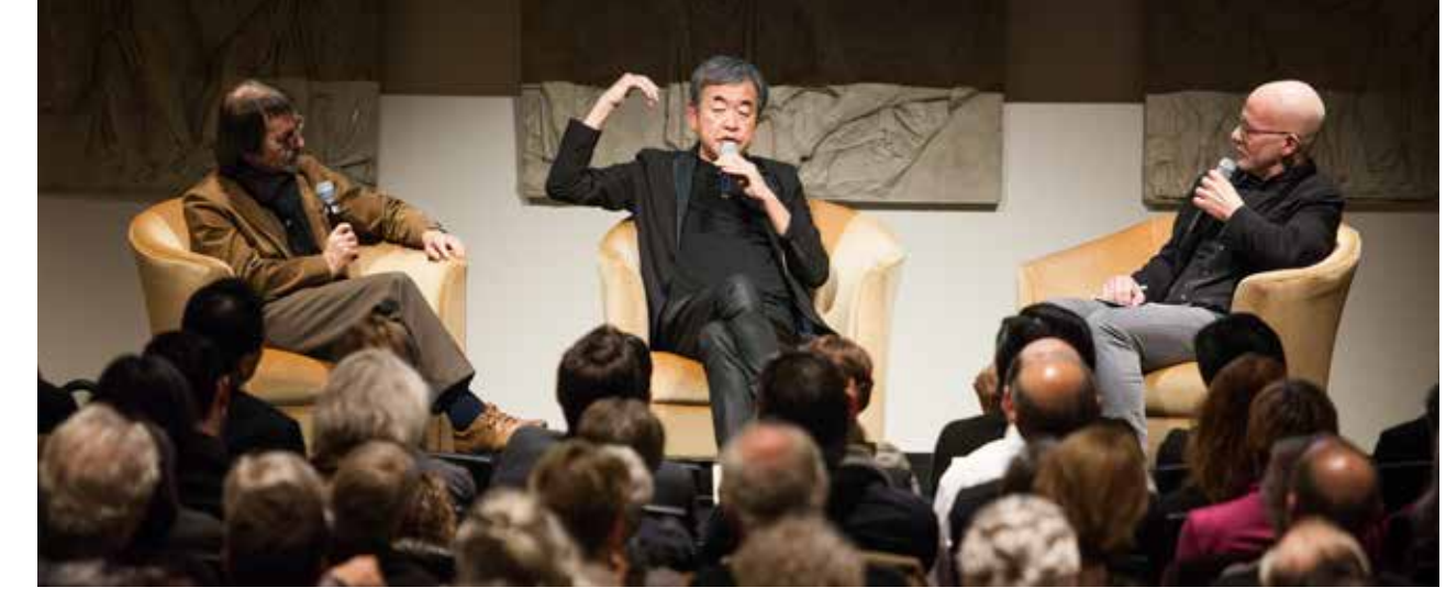
Kengo Kuma during a symposium in Portland

With the much-anticipated launch of the Japan Institute in 2022, the commitment and extensive personal networks of our IAB members enable us to continue to expand our reach on a