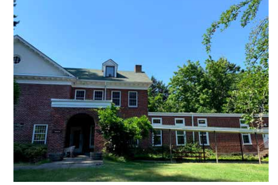
The main builing at the Japan Institute campus.

For nearly 60 years, Portland Japanese Garden has helped to shape our city's identify as a place that reveres nature, a "City of Gardens", and a place that brings different peoples and cultures together. Take a glimpse at the community that the Garden has created through these photos.