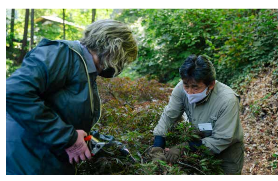
Scene from the International Japanese Garden Training Center's Maple Pruning Workshop in August.