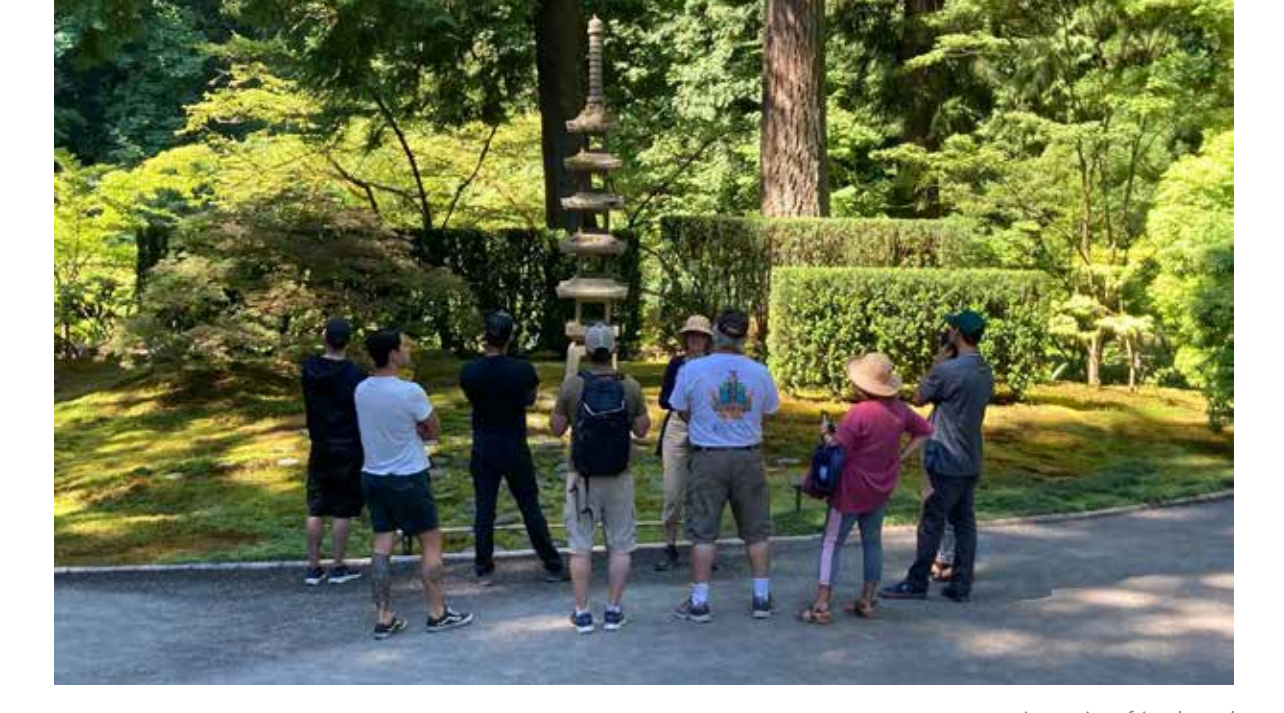
Long-time friends and sponsors Treecology, Inc. visited the Garden for an exclusive tour.