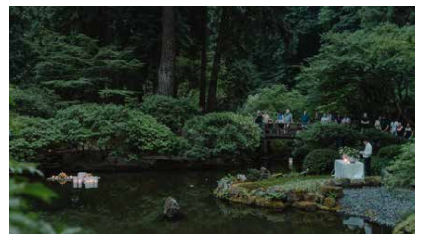
O-Bon celebration at the Strolling Pond Garden.