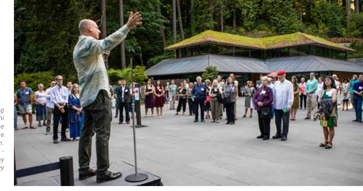
Guests gathering at the Tateuchi Courtyard for the Golden Crane Annual Reception.