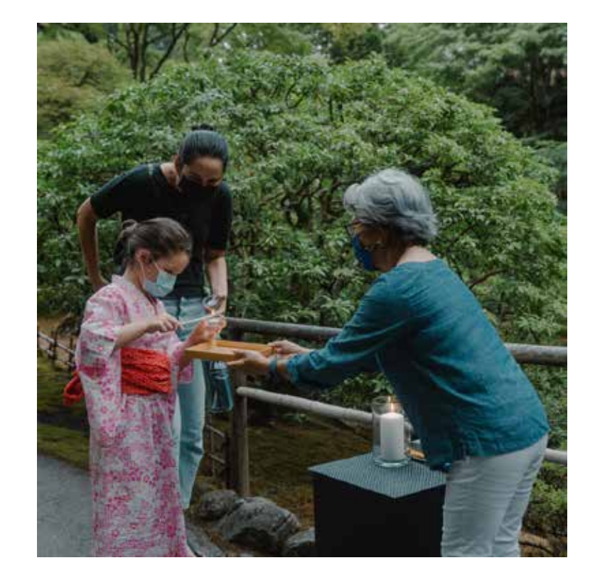
Lighting of candles in memory of loved ones during our O-Bon festival in September.