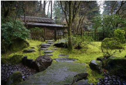
Tea Garden with Kashintei Tea House

Portland Japanese Garden was originally established with five distinct garden styles: