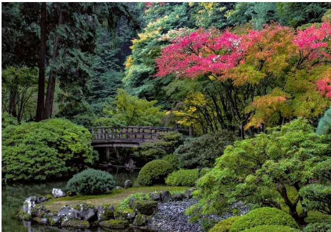
Strolling Pond Garden