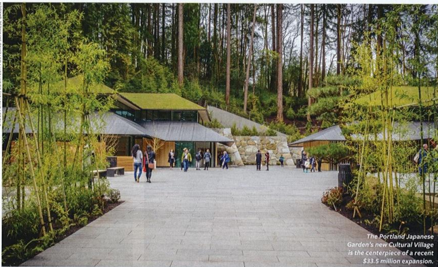
The Portland Japanese Garden's new Cultural Village is the centerpiece of a recent $33.5 million expansion.