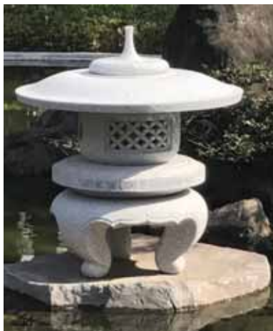
The new Peace Lantern in Higa-en, Yokohama, Japan