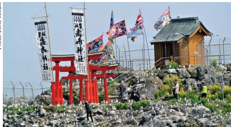
▲ There now stand three torii gates in front of the Itsukushima Shrine outside Hachinohe: one which was erected after the tsunami and the two original torii which have now been returned