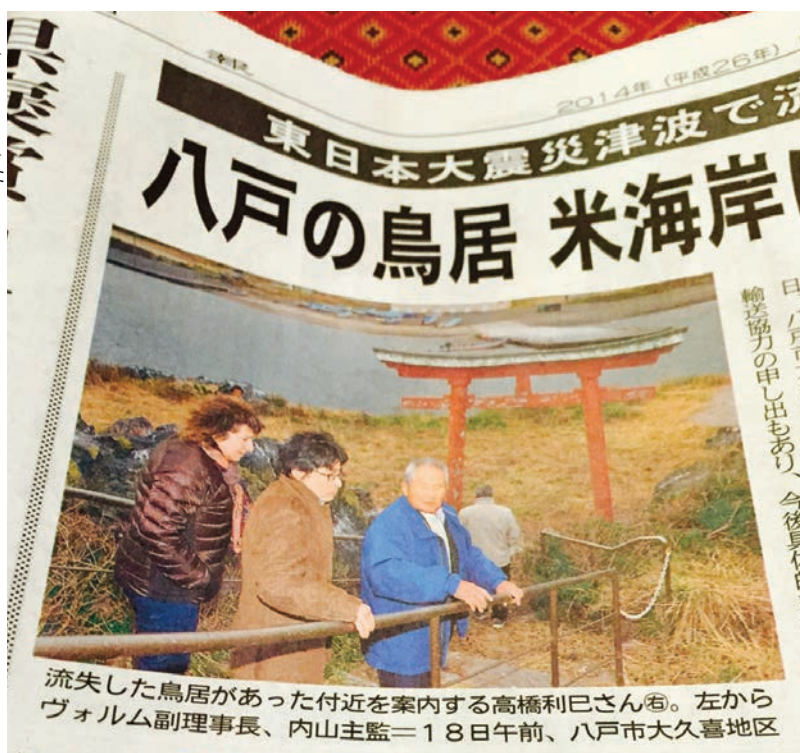
▲ "Torii from Hachinohe washed onto a U.S. Coast"