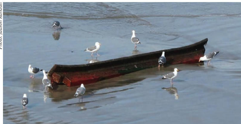
▲ On March 22, 2013 an unknown artifact appeared on the shores of Oceanside, Oregon